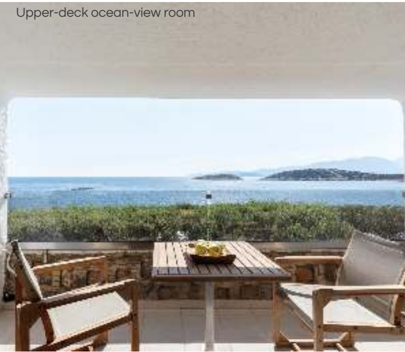
Upper-deck ocean-view room