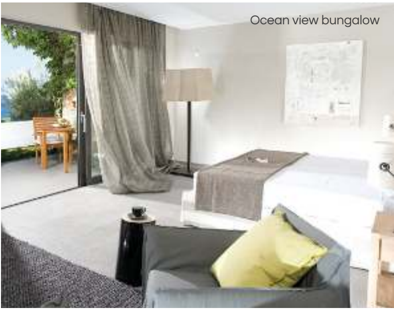
Ocean view bungalow