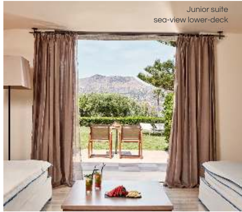
Junior suite sea-view lower-deck