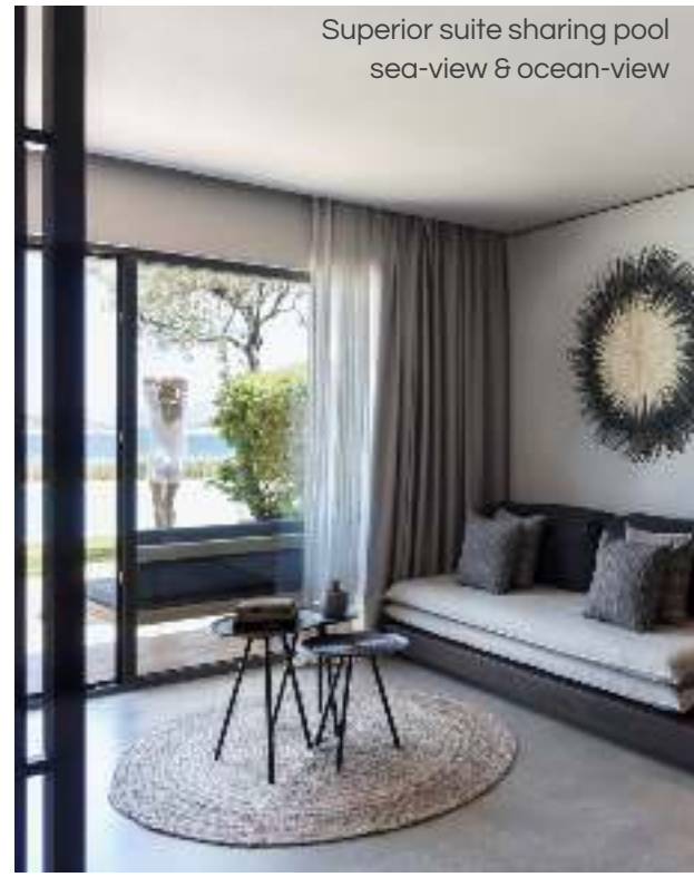
Superior suite sharing pool sea-view & ocean-view